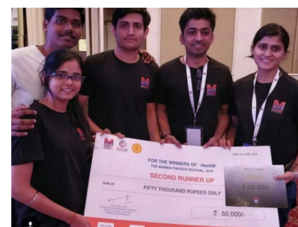
HackM 2nd Runner up