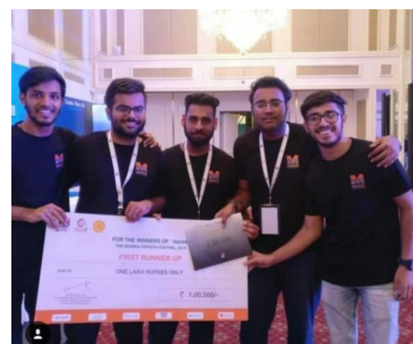
HackM 1st Runner up