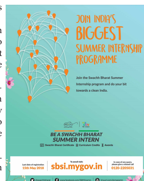
Poster of Swachh Bharat Internship

We all keep complaining about India being so dirty and people defecating openly. Here is your chance to go and fix this. If you cannot change things then you have to be the change. Moreover, this campaign gave people a sense of satisfaction beyond anything else, the satisfaction of making a difference.