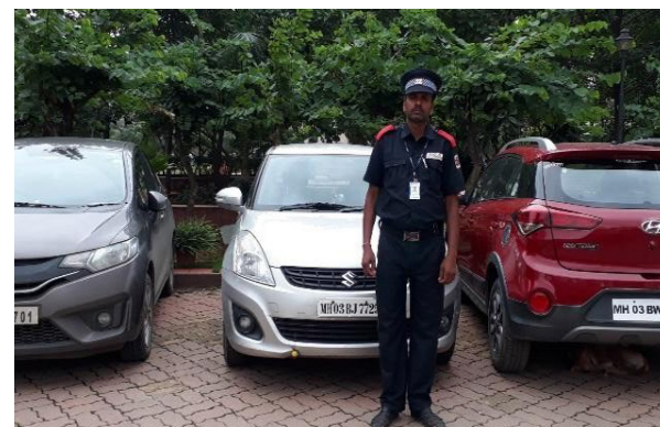
Mr Kusvaha near the cars

For all the VES boys and girls living in the hostel, the security people are the most helpful people. They might be strict in following the rules of restraining the students from entering the hostel late, but these watchmen also provide a strong helping hand when they need them. Mr. Ashish Upadhyay, the day shift watchman posted at the entrance of the hostel, is the person for the kids to turn to, in the hostel. The hostel students along with the security have their own Whatsapp group. He informs the students on the group if they receive any parcel so that it can be delivered to them on time. The students also inform the watchmen on a Whatsapp group if they have a problem. The security team knows all the electrician, plumber and the dhobis that come to the hostel and call them as and when needed by the children. Mr Upadhyay lives in a rented space near Chembur Naka, which he shares with his colleagues, so that he can save more money to send back home to his family who lives in his village.