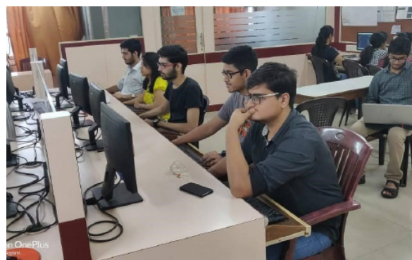
Interns working on projects