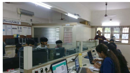
Students at ISA Workshop